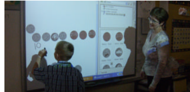
A student at Coolidge Elementary practices monetary value using the latest interactive whiteboard technology