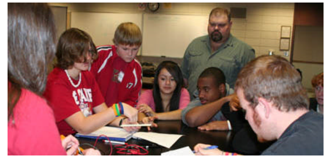
Longfellow MS students tour Autry Technology to learn about career opportunities and training

Distance from OKC: 85 Miles Tulsa: 120 Miles