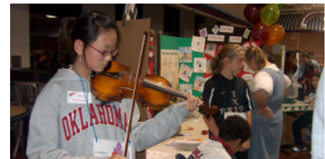
Eisenhower Elementary students share what they have learned with the community during the Schools Attuned Fair