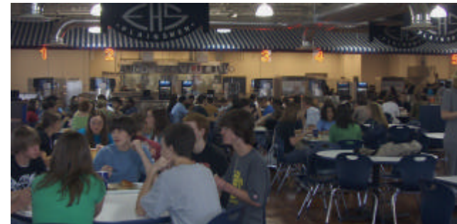
EHS students enjoy lunch in the food court, which features small-group dining and a dozen food choices